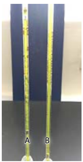
Figure 1. Acriflavine test: Tube A, positive reaction of heavy flocculation precipitate using inoculum of P. multocida serogroup D and acriflavine solution. Tube B, negative reaction.

of slide agglutination test were identified as type B.